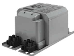
BHL K307/K327 BC2-134