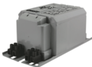
BHL K307/K327 BC2-160